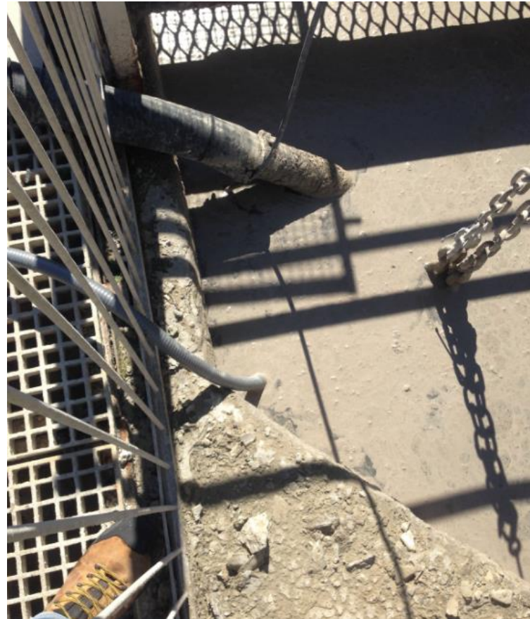
Drained reclaimed water tank – for settlement