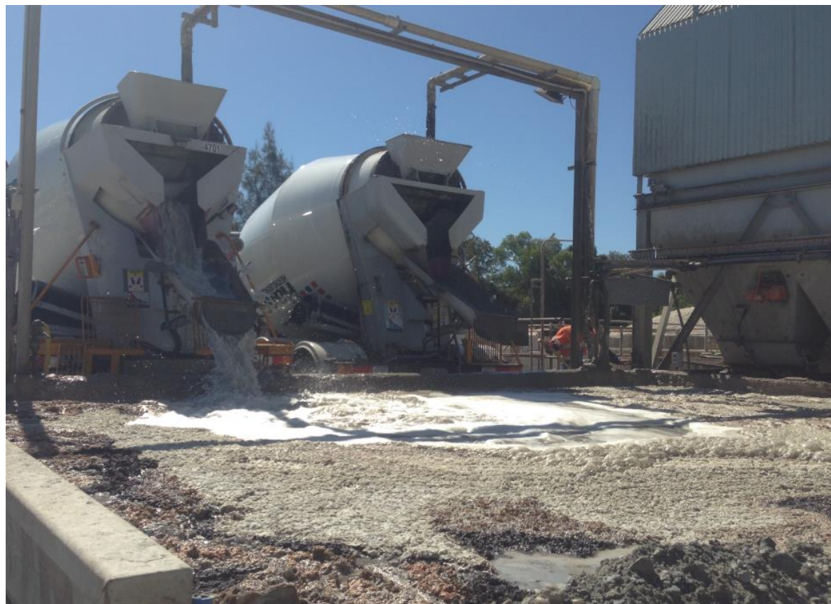
Returned truck wash out tank