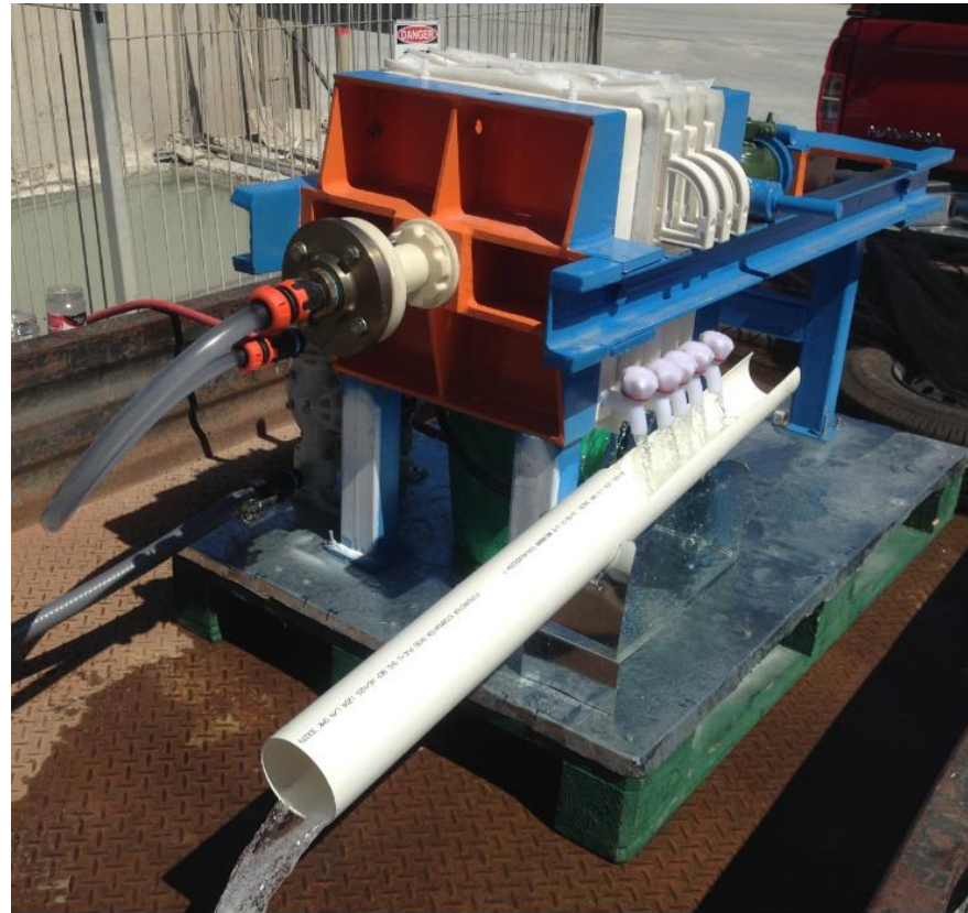
Wash out water tank pumped into Filter Press Small 3 plate press operating at 1L/s