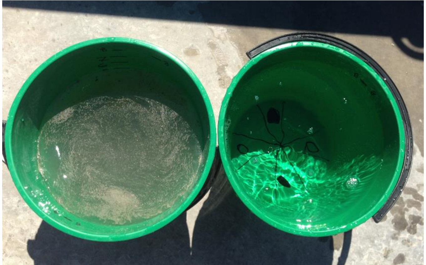
Reclaimed water Before and After Filter Press