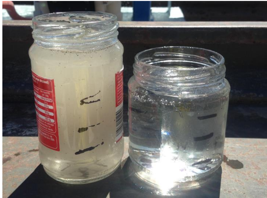
Reclaimed water Before and After Filter Press