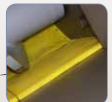
SINT® Drainage Module