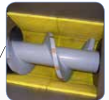
Engineered Screw Conveyor