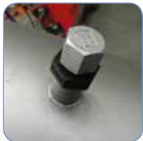
Emergency Fluidisation Nozzles