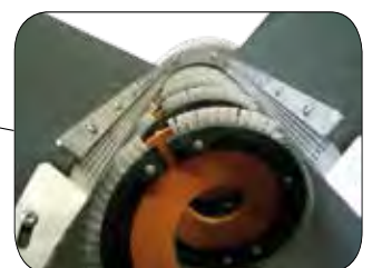
Inlet Screen Basket with Splash Guard