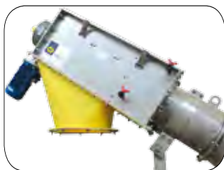
Polymer Outlet with Compacting Washing System