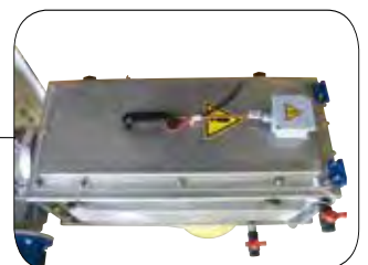
Insulated Discharge Module