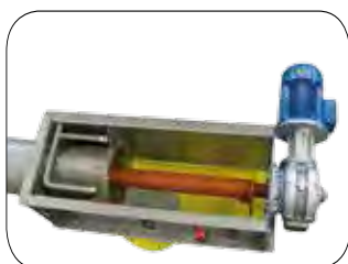
TSF-1 Outlet Top View