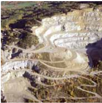
Quarries and Mines