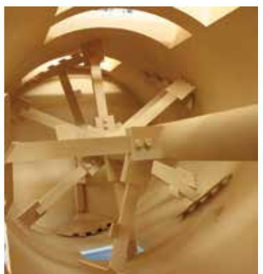
Special tool arrangement for different applications