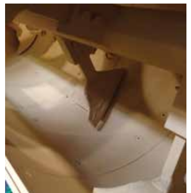
Chamber liner in special anti-wear material