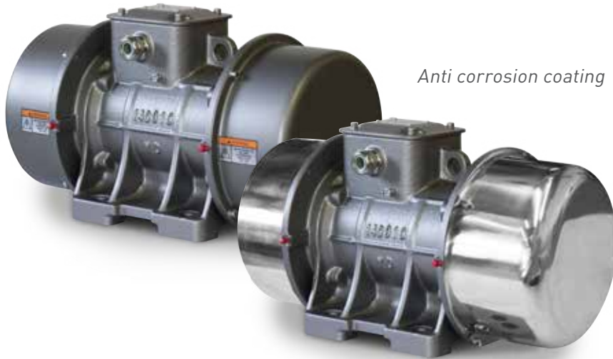
Anti corrosion coating

MULTIPLE SOLUTIONS SPECIFIC FOR FOOD PROCESSING APPLICATIONS