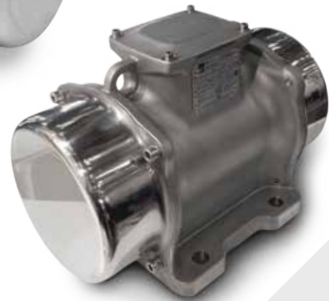
Stainless steel range

MULTIPLE SOLUTIONS SPECIFIC FOR FOOD PROCESSING APPLICATIONS