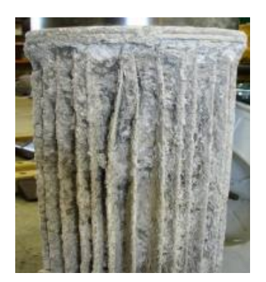
Vac Truck Filter that has not been maintained