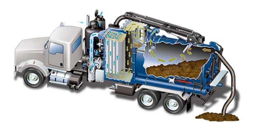
"Specialists in material handling equipment for powders & granules."