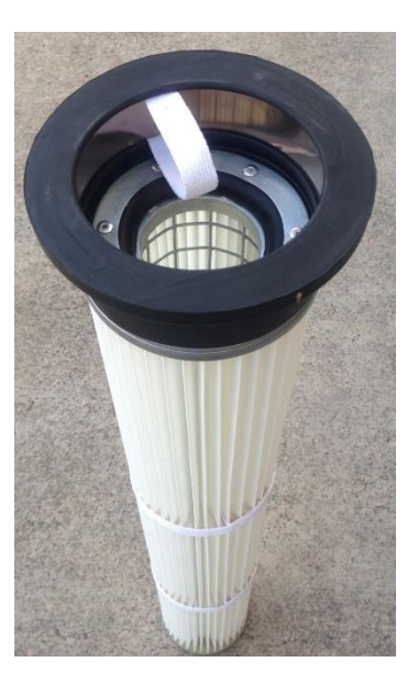
Filquip PB15510 Vac Truck Replacement Filters "Available off the Shelf"

The filters play a critical role in protecting the blower from damaging foreign materials. Good filters reduce the vacuum pressure required to be generated and results in less energy/fuel being required to operate the Vac Truck. Broken or low efficiency filters can result in the lobes of the blower being eroded adding extra maintenance and unexpected shut down costs.