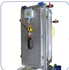
Insulated discharge module