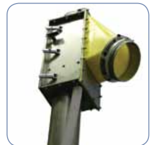
Highly efficient outlet spout in plastic material