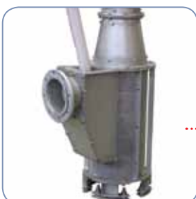
Inlet spout and split screen basket